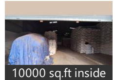
10000 sq.ft inside