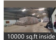
10000 sq.ft inside