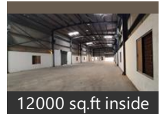
12000 sq.ft inside