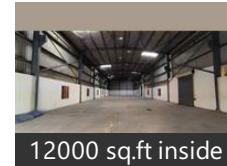
12000 sq.ft inside