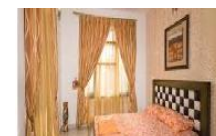
Master Bed Room

* These pictures are of the project and might not represent the property