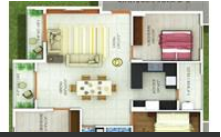
Floor plan D