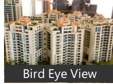
Bird Eye View