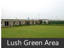
Lush Green Area