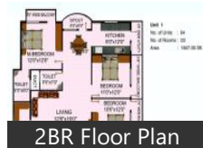
2BR Floor Plan