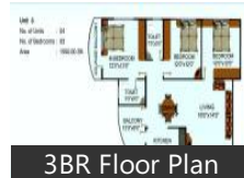
3BR Floor Plan