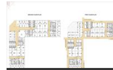
FLOOR PLANE A