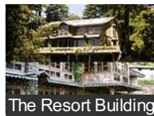
The Resort Building