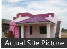
Actual Site Picture