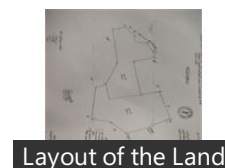
Layout of the Land