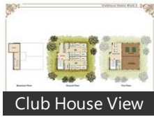
Club House View