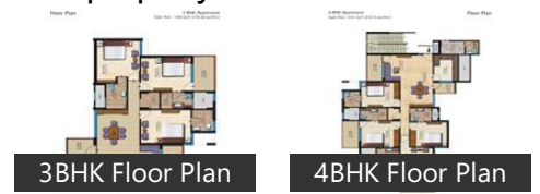
* These floor plans are of the project and might not represent the property

Disclaimer: All information is provided by advertisers and should be verified independently before entering into any transaction. You may visit the relevant RERA website of your state to verify the details of this property. PropertyWala.com is only an advertising platform to help connect buyers and sellers and is not a party to any transactions, nor shall be responsible or liable to resolve any disputes between them.