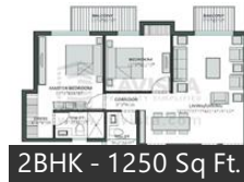
2BHK - 1250 Sq Ft.