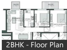
2BHK - Floor Plan