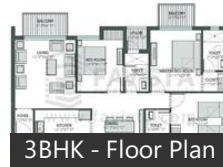
3BHK - Floor Plan