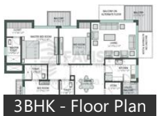
3BHK - Floor Plan