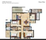
4BHK Floor Plan

* These floor plans are of the project and might not represent the property