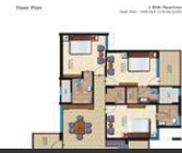
3BHK Floor Plan

Disclaimer: All information is provided by advertisers and should be verified independently before entering into any transaction. You may visit the relevant RERA website of your state to verify the details of this property. PropertyWala.com is only an advertising platform to help connect buyers and sellers and is not a party to any transactions, nor shall be responsible or liable to resolve any disputes between them.