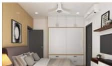
Master Bed Room