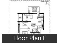
Floor Plan F