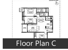
Floor Plan C