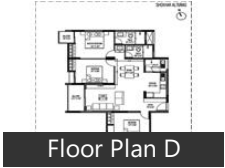
Floor Plan D