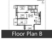
Floor Plan B