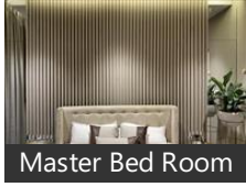
Master Bed Room