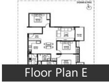
Floor Plan E