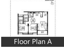
Floor Plan A