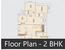
Floor Plan - 2 BHK