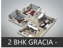
2 BHK GRACIA -