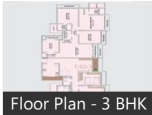
Floor Plan - 3 BHK