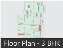
Floor Plan - 3 BHK