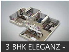
3 BHK ELEGANZ -