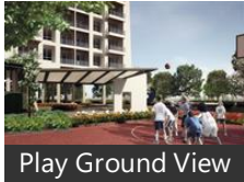
Play Ground View