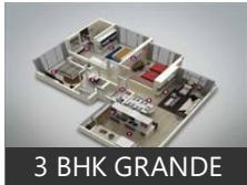
3 BHK GRANDE