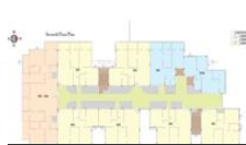
Floor Plan E