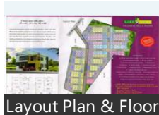
Layout Plan & Floor