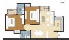
2 BHK Floor Plan