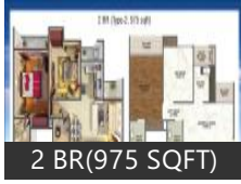
2 BR (975 SQFT)