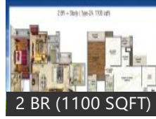
2 BR (1100 SQFT)