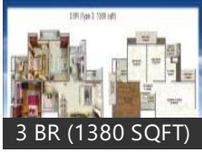
3 BR (1380 SQFT)