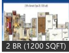
2 BR (1200 SQFT)