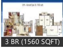
3 BR (1560 SQFT)