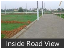
Inside Road View