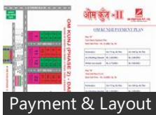
Payment & Layout