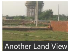
Another Land View