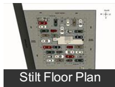
Stilt Floor Plan