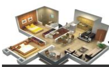
3D Floor Plan 1