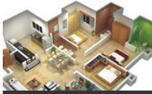
3D Floor Plan 2