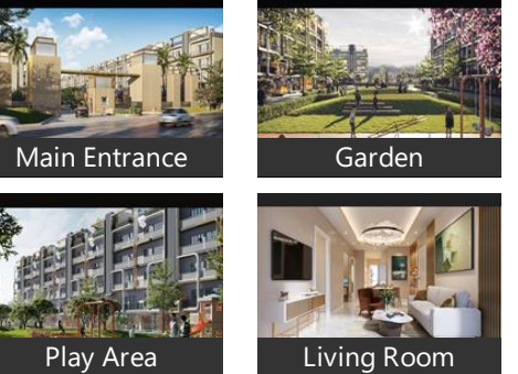
* These pictures are of the project and might not represent the property