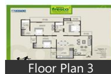
Floor Plan 3