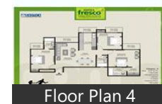
Floor Plan 4