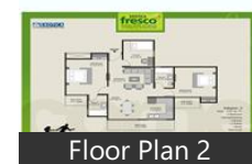
Floor Plan 2