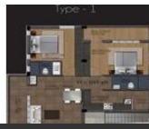
2BHK - 1042 Sq. Ft.