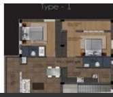
2BHK - 1024 Sq. Ft.