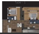
2BHK - 1090 Sq. Ft.