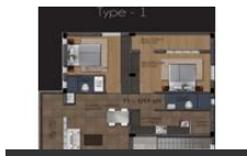
2BHK - 1207 Sq. Ft.