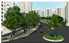
Road Side View