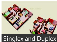
Singlex and Duplex