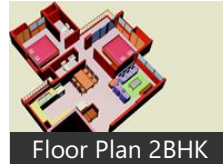
Floor Plan 2BHK