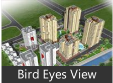
Bird Eyes View