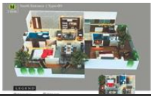
Floor Plan C