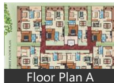
Floor Plan A