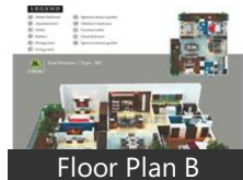
Floor Plan B