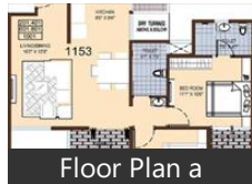
Floor Plan a