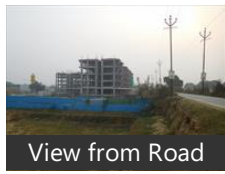
View from Road