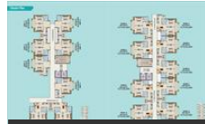
Cluster Plan C