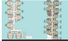
Cluster Plan B