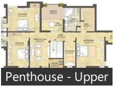
Penthouse - Upper