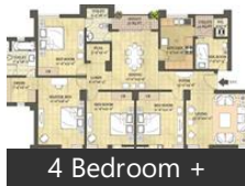
4 Bedroom +