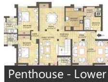
Penthouse - Lower