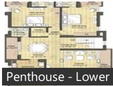
Penthouse - Lower