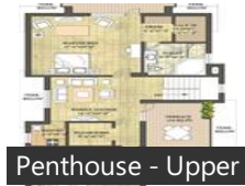
Penthouse - Upper