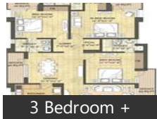
3 Bedroom +