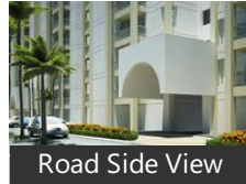
Road Side View