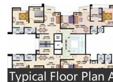
Typical Floor Plan A