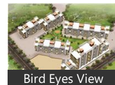
Bird Eyes View

* These pictures are of the project and might not represent the property