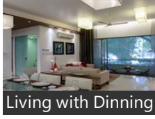
Living with Dining