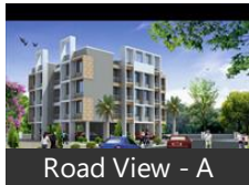
Road View - A