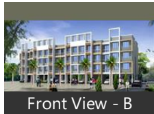
Front View - B