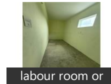
labour room or