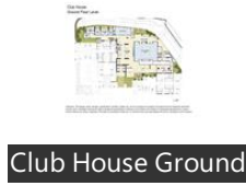
Club House Ground