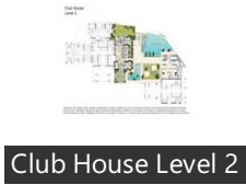
Club House Level 2