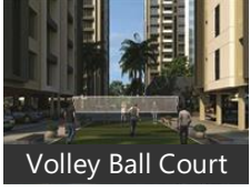
Volley Ball Court