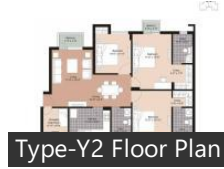
Type-Y2 Floor Plan