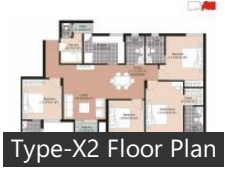
Type-X2 Floor Plan