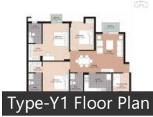
Type-Y1 Floor Plan