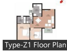
Type-Z1 Floor Plan