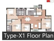
Type-X1 Floor Plan