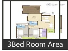
3Bed Room Area