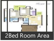
2Bed Room Area