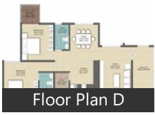
Floor Plan D