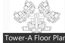
Tower-A Floor Plan