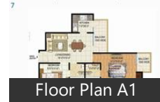
Floor Plan A1