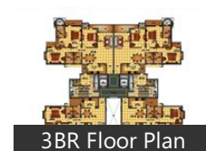
3BR Floor Plan