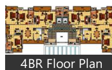
4BR Floor Plan

* These floor plans are of the project and might not represent the property