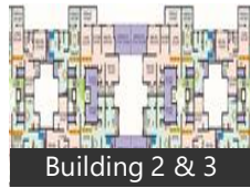
Building 2 & 3