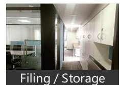
Filing / Storage