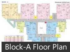
Block-A Floor Plan