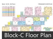
Block-C Floor Plan