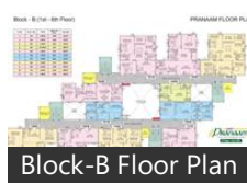
Block-B Floor Plan