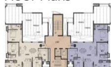
Floor Plan for 4BHK