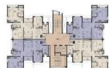
Floor Plan for 3BHK