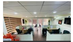
Work Station Area