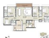
Unit 2-Wing A