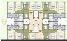
Typical Floor Plan-A