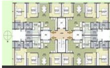
Typical Floor Plan-B